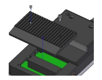
Figure 7 Lithium Battery Compartment