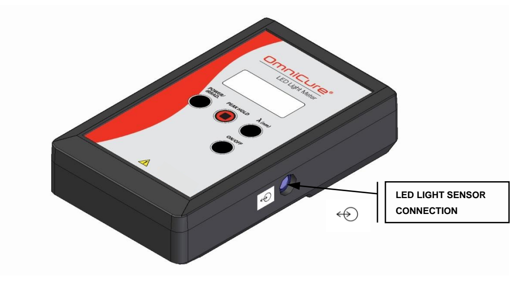
Figure 2 LED Light Sensor Connection