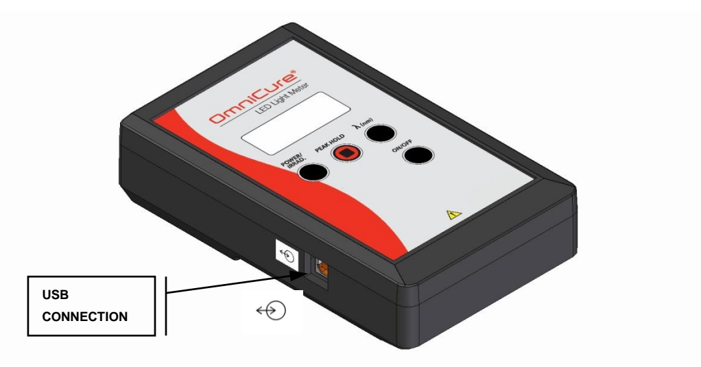
Figure 3 USB Connection