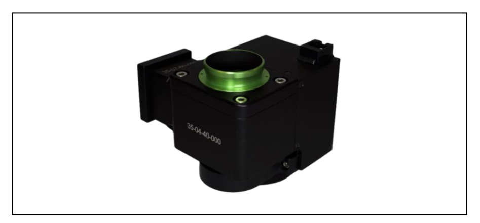
Optem® FUSION focusing module providing automated high-precision focusing capabilities with coaxial illumination.

The Optem® FUSION motorized focus module delivers rapid high precision, repeatable focusing across travel ranges far greater than conventional piezo-driven solutions. Precision engineered with high durability ensures focus is maintained for the full life cycle of demanding high-throughput imaging applications