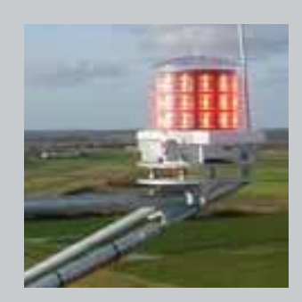
Aircraft Warning Lights

Excelitas partnered with this market leader to accelerate introduction of this premier LED-based surgical lighting which had low power consumption, long life, high CRI, reduced heat output, excellent shadow control and a crisp, adjustable spot.