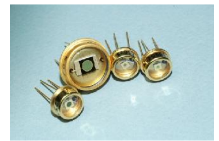
Excelitas YAG-enhanced avalanche photodiodes

Excelitas' avalanche photodiode (APD) is the main detector enabling the OSIRIS-REx Laser Altimeter to scan and map the asteroid's entire surface and provide higher-resolution topographical information than ever before possible. The resulting 3-D topographical maps of Bennu, the most detailed ever to be captured of an asteroid, will provide fundamental and unprecedented data to help study asteroid shape and topography and will allow the mission team to select potential sites for sample collection.