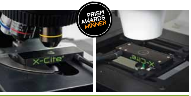
X-Cite XP750 in use on upright and inverted microscopes

Since the X-Cite XP750 measures light right on the stage, it can be used with any epi-fluorescence light source including: HBO / mercury, metal halide or xenon lamps, lasers and LEDs. With hundreds of wavelength choices, the X-Cite XR2100 allows you to define 'favorite wavelengths' to correspond to your most frequently used sources and filters.