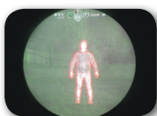
FUSED I2-TI + TI OUTLINE