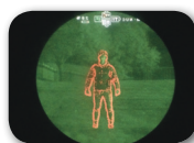
FUSED I2-TI + OUTLINE ONLY