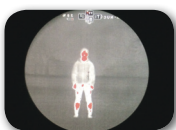
THERMAL + THRESHOLD