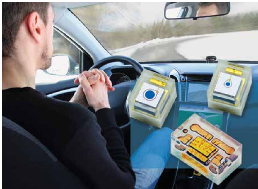
Autonomous vehicles, or self-driving cars, will use lidars to safely navigate. APDs are a critical part of the lidar technology that probes the car's environment.

“For SiPMs, molecular imaging is among the main applications driving the