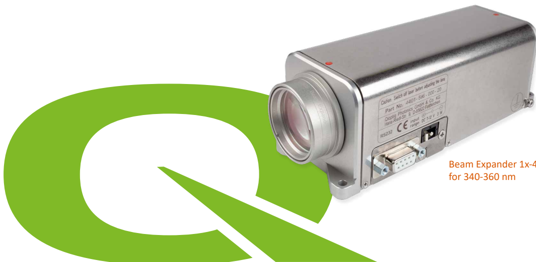
Beam Expander 1x-4x for 340-360 nm