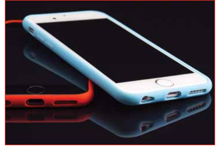
FIGURE 1: Phone speakers

The diaphragm, usually made of paper, plastic or metal, has its wide end attached to the suspension, a rim of flexible material that allows the cone to move. The narrow end of the diaphragm's cone is connected to the voice coil. The voice coil is attached to the basket by the spider, which holds the coil in position, but allows it to move freely back and forth. A permanent magnet is located directly below the voice coil.