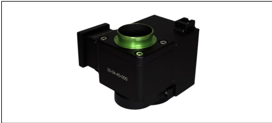
Optem® FUSION focusing module providing automated high-precision focusing capabilities with coaxial illumination.

The Optem® FUSION motorized focus module delivers rapid high precision, repeatable focusing across travel ranges far greater than conventional piezo-driven solutions. Precision engineered with high durability ensures focus is maintained for the full life cycle of demanding high-throughput imaging applications