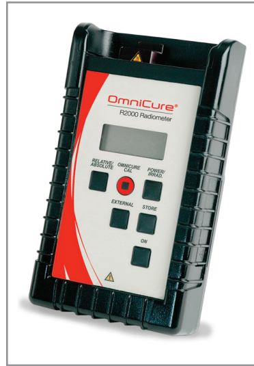
Figure 2: OmniCure R2000 Radiometer

The OmniCure S2000 Elite UV Spot Curing System is simple to use, and provides the highest levels of control and repeatability, making it ideally suited for today's growing medical device market.